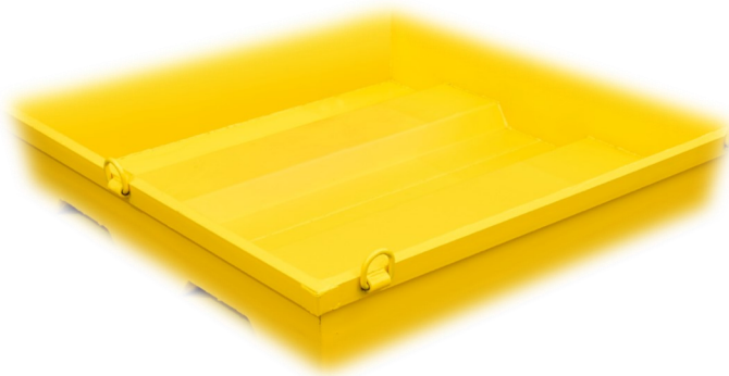
Portable Concrete Wash Out Basin

Some Examples of washouts that can be used.