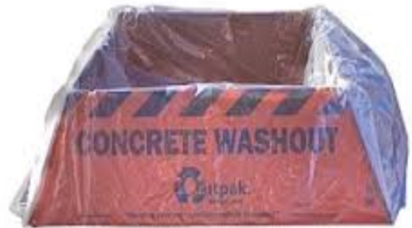
Disposable Wash Out Basin