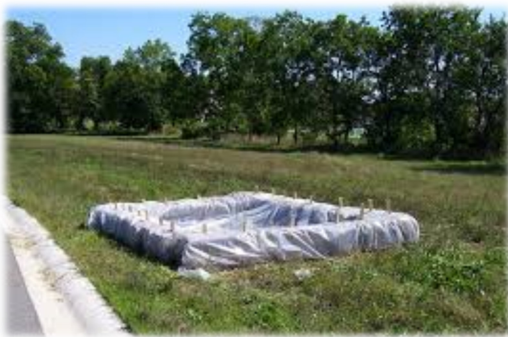
Temporary concrete wash out site preventing contaminants from entering the ground and the storm system.